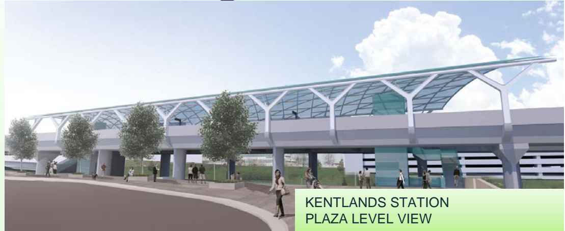
KENTLANDS STATION PLAZA LEVEL VIEW