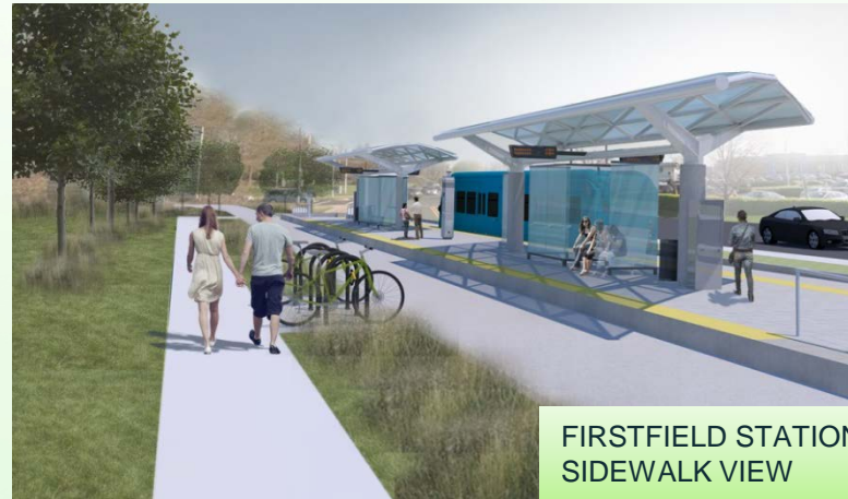
FIRSTFIELD STATION SIDEWALK VIEW