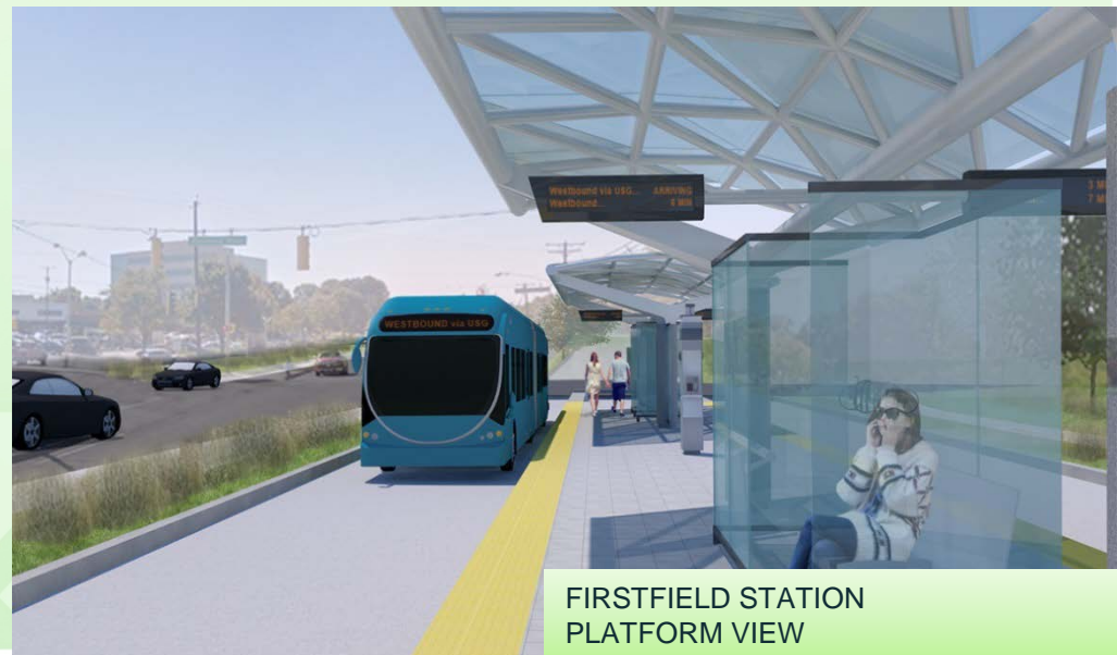
FIRSTFIELD STATION PLATFORM VIEW